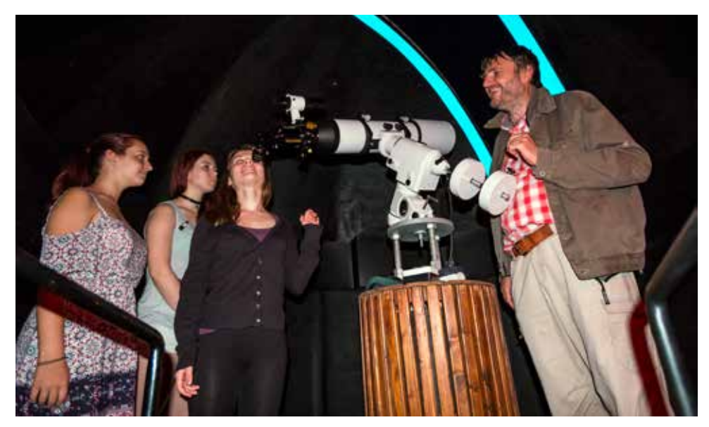
Stargazing program in the park's observatory

Astronomy became part of the park's Field Study Center's curriculum. The park has recently established a public astronomical observatory as part of the development of the Center. It is equipped also by all-sky camera and permanent SQM too.