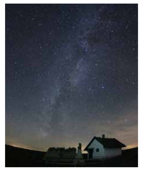
Traditional shepherd building with the Milky Way