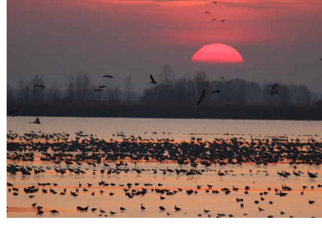
The obtrusive light-free environment is essential for the wildlife as e.g. insects at night and the protection of migratory birds.

The masses of migration are remarkable too: for instance 100,000-300,000 of grey geese species (Answer sp.), app. 100,000 cranes (grus), or 50,000-200,000 Ruffs stop at Hortobágy (the last one basically while shallow-water covered conditions occur on grasslands). 10-20 years ago hundreds of thousands of different duck species stopped here too, but their mass has been less significant recently. It is notable that many of the important breeding and nesting bird species (geese, crain, crakes etc.) and other species especially many rare insect species are light-pollution sensitive.