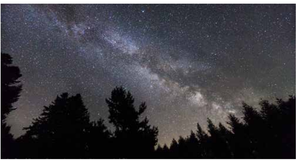
Official webpage of the "Bieszczady" Starry-Sky Park : www.gwiezdnebieszczady.pl The symbol of the Starry-Sky Park "Bieszczady" was chosen silhouette of the Lynx at background of the constellation Lynx.