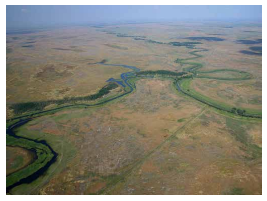
Hortobágy from above. You can see the Hortobágy River and the typical steppe with wetland mosaics

Hortobágy is also one of the biggest unpopulated and darkest areas in Hungary. Its significance is mostly related to the high biodiversity, especially the great number of migrating bird species and special nocturnal insect species.