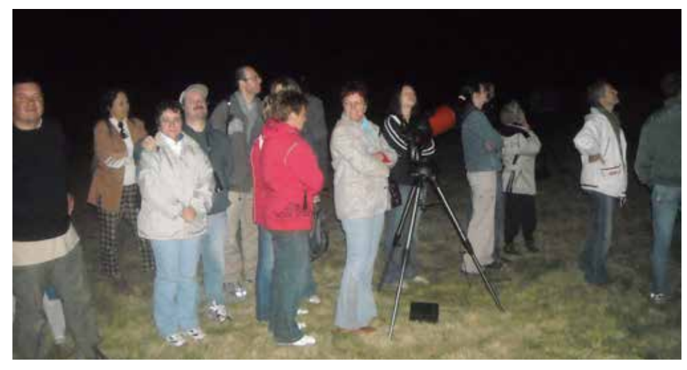
Group of astro-tourists into the park