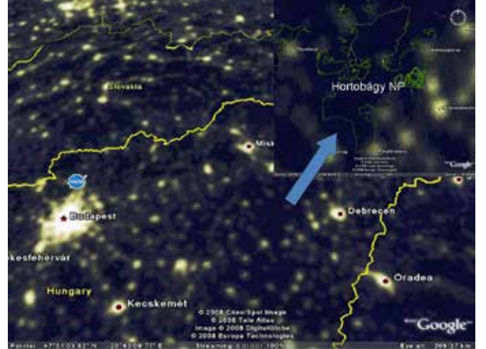
The park on the Google Earth night-time satellite map

Hortobágy got its "dark-sky park" diploma from the International Dark Sky Association in 2011 according to the nomination submitted in 2010. To be a dark sky park is an important tool to protect the nocturnal wildlife habitats and also the landscape values of Hortobágy as an outstanding and unaltered wilderness area in the Great Hungarian Plain, in the middle of Europe which is also an important tourist destination. Now the dark-sky values provide new attraction to the area.