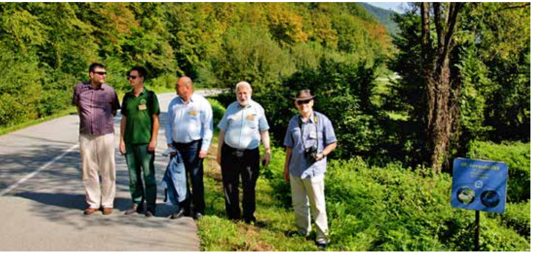
On the photo above group of project executors are standing on the line of 49 parallel.

6. The memorial to the Victims of Light Pollution, Zboj is located in the village of Zboj. There are six information boards providing information on the adverse effects of light pollution on humans, animals and plants.