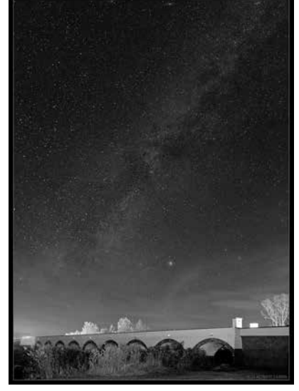
The "Nine-hole Bridge" is one of the symbols of the WH site, with the Milky Way can be the symbol of the Dark-sky Park.